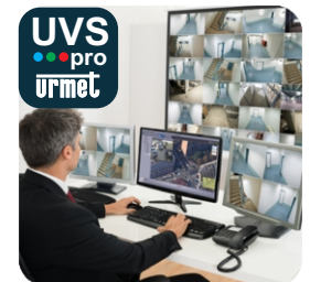
Video Management Software